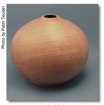
Red Oak 8" x 9" Mike Green