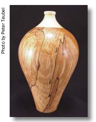
Spalted Beech 3 1/2" x 6" Peter Teubel

"In order for our club to prosper, we need to know what YOU want."