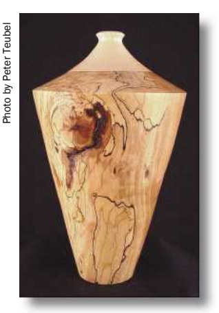
Spalted Beech 4 1/2" x 7" Peter Teubel