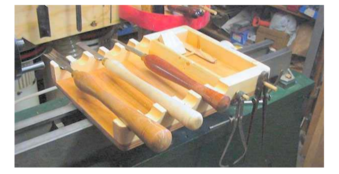
Handy Tool Tray slides onto lathe bed Mike Green

"...flexible metal foil dryer hoses are ideal for a dust collection nozzles."