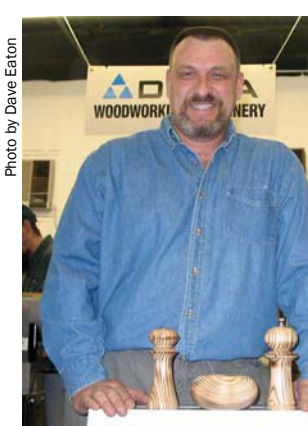
Scorched Ash Table Set Peter Teubel