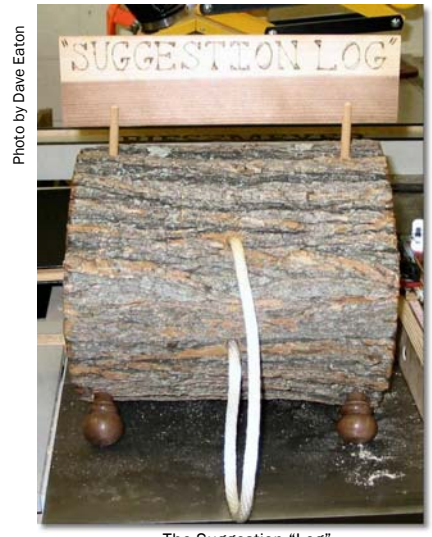
The Suggestion "Log" Mike Green

Remember to bring your new projects to each meeting for show & tell!