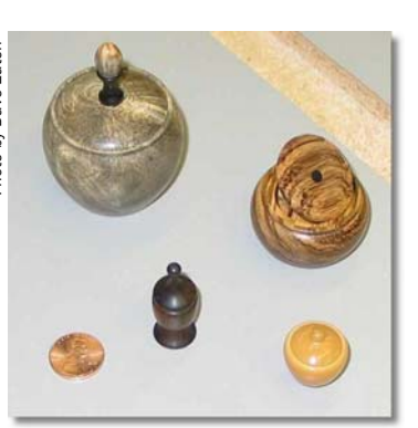
Miniatures w/Snap Lids Jeff Levine