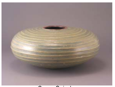
Green Spirals Derrick TePaske

"All it takes is a phone call to make an appointment."