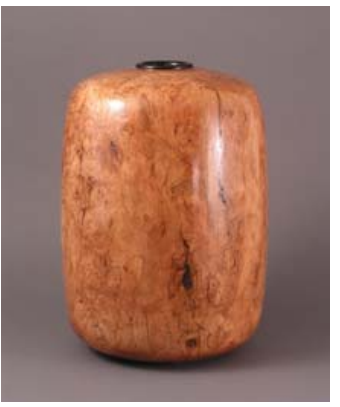
Cherry Burl Derrick TePaske

" Ever try to drill thru welds? Without a sharp bit, you might as well use your teeth. "