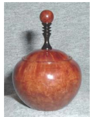
" Meanwhile, Jeff is teaching an occasional class at Wood Craft... "