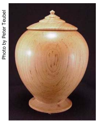
Cherry Pet Urn Peter Teubel

I go thru A LOT of bandsaw blades (sometimes 3 per day). While I try to keep a good supply of new ones on hand, sometimes my inventory control system fails and I end up with a dull blade with new replacements a couple days away. Here the procedure I use for my 3/8" 3TPI hook tooth blades: Unplug the saw (very important). Remove the upper wheel housing. Holding a stone on the table and lightly against the blade (as if you were trying to CUT the stone), manually rotate the wheel BACKWARDS until the blade has made two or three complete passes over the stone. This will cause the blade to rub against the stone and take a little bit of metal off the hook each o f tooth...hence a new cutting edge. I've found that this procedure works well for two sharpenings. While it won't get the blade back to "new", it'll sharpen the teeth enough to keep me going for awhile. You also might want to angle the stone a bit to match the "set" of the teeth ... a couple passes angled left and an equal number of passes angled right.