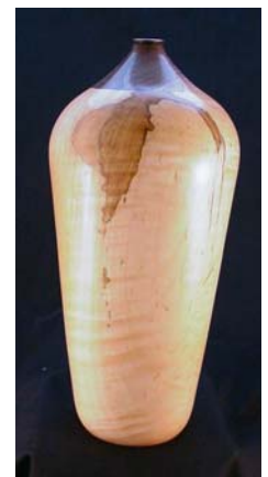
Spalted Maple & Walnut Peter Teubel