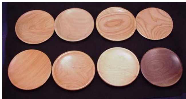
Various Plates for Wood Species Display Peter Teubel

“If anyone would like to donate any ORIGINAL videos (no copies), please contact any of the club’s officers.”