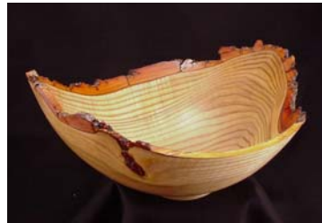
Sassafras Peter Teubel

Sometimes we have a really punky piece of spalted wood that just doesn't want to cut cleanly. Try soaking the whole thing is a 50/50 mixture of white glue & water for a few days. Take it out and put it aside for a week or two. The water will swell the fibers, cracks shut, and the glue will hold it together.