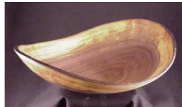
Walnut Peter Teubel

“ Try soaking the whole thing is a 50/50 mixture of white glue & water...”