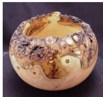
Box Elder Burl Peter Teubel

“ Try soaking the whole thing is a 50/50 mixture of white glue & water...”