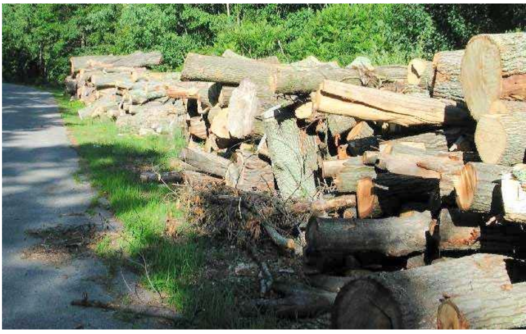
"There's gold in them thar logs!"