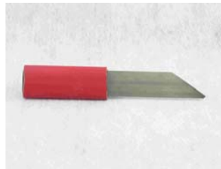
Ultra-Thin Parting Tool

Please add $5.00 Shipping and Handling to your order (no matter the number of items ordered being shipped to the same address at the same time).