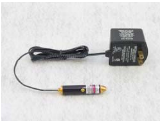
110 VAC Laser Pointer