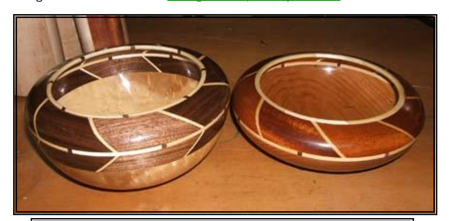
Steve Resnick, segmented bowls, mahogany/maple; maple/walnut

Anyone interested in helping in the salvage efforts or the wood for turning should contact Devon at <a href="mailto:undergroundcarpenter@yahoo.com">undergroundcarpenter@yahoo.com</a>