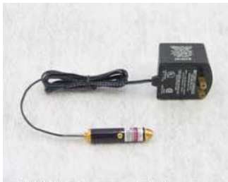
110 VAC Laser Pointer