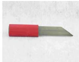
Ultra-Thin Parting Tool

Please add $5.00 Shipping and Handling to your order (no matter the number of items ordered being shipped to the same address at the same time).